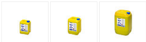
Item no. 821 005 Item no. 821 010 Item no. 821 025