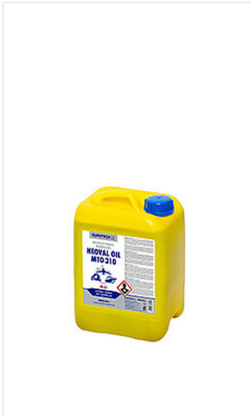
Item no. 821 005 Canister 5 Lt.