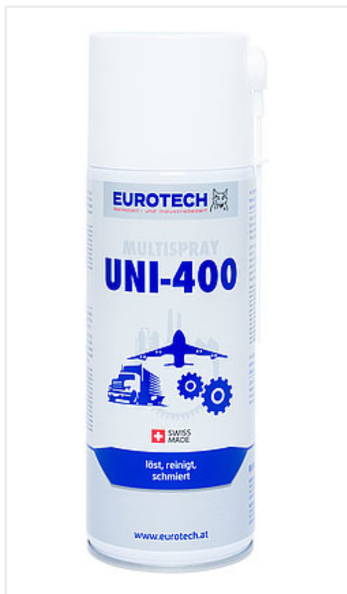
Item no. 816 400 Aerosol can 400 ml